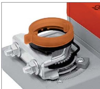
Visual indicator mounted on axle to indicate throttle valve position