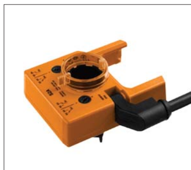
Optional S2-A position detector