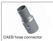
CAEB hose connector