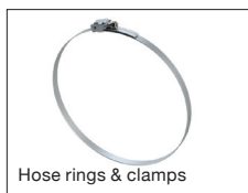
Hose rings & clamps